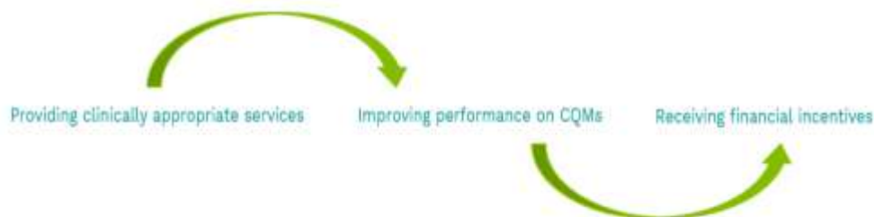
Figure 5. Relationship between patient care and quality awards.

Implementing the National DPP can benefit a Community Health Center by providing an infrastructure through which patients can receive comprehensive preventive and primary care services. 11 Offering clinically appropriate services to patients who participate in a National DPP lifestyle change program can, in turn, help Community Health Centers improve their performance on CQMs, such as those identified by the Healthcare Effectiveness Data and Information Set (HEDIS). HRSA tracks many HEDIS measures, and offers Quality Awards 12 for Community Health Centers that show improvement on their performance for some CQMs. As a result, using the National DPP to provide more comprehensive care for patients can result in a Community Health Center receiving a financial award (see Figure 5).